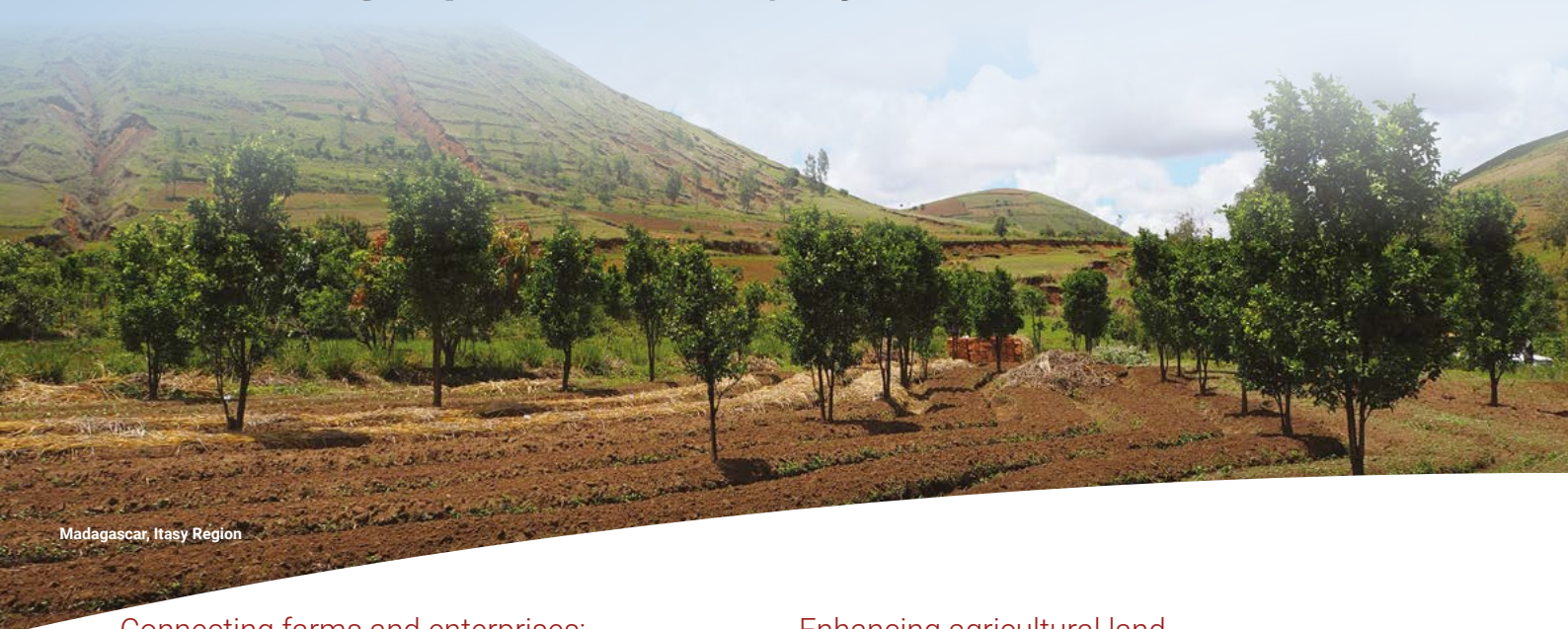
Madagascar, Itasy Region