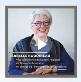
... by spreading our vision